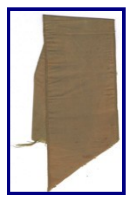
Ribbon, significance unknown.