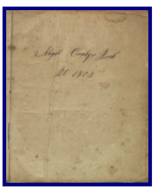
Abigail Crosby's Book Bt 1808 [Page Two -- Family Record Births]